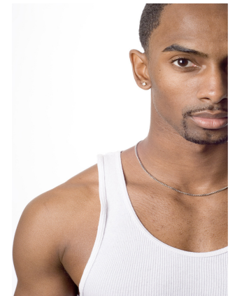
*Please note that real names are not used in any client story.